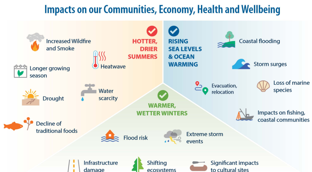
Figure 1 – Impacts on our Communities, Economy, Health and Wellbeing (from BC's Climate Adaptation and Preparedness Strategy at p. 19)

Figure 1 shows some of the climate change impacts facing BC communities. Each of these impacts results in hefty costs, often borne by local governments.